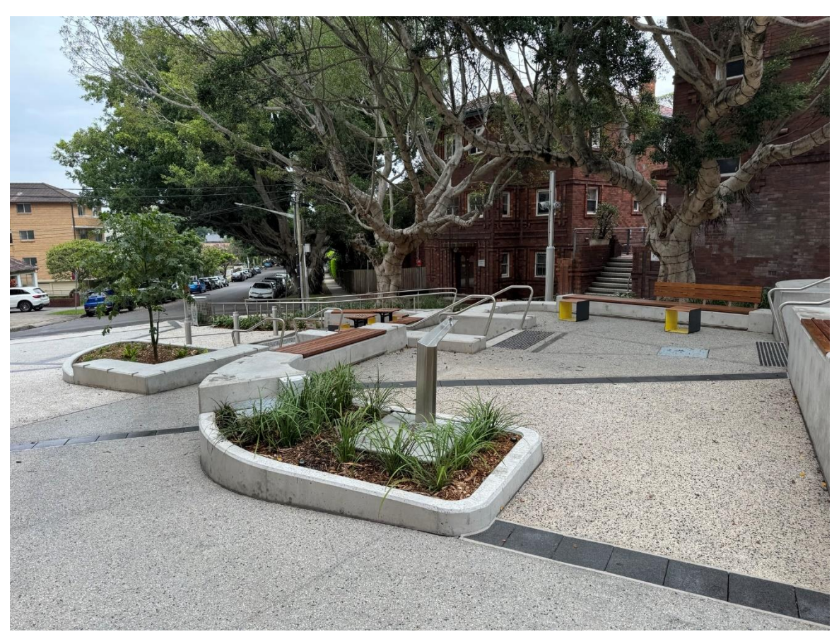
Photograph 1 - Waratah Avenue Plaza

It is proposed to extend the existing Randwick AFZ to include the Waratah Avenue Plaza. The extent of the existing Randwick AFZ and proposed extension is shown in Attachment 1. The AFZ will be in force until 30 November 2027.