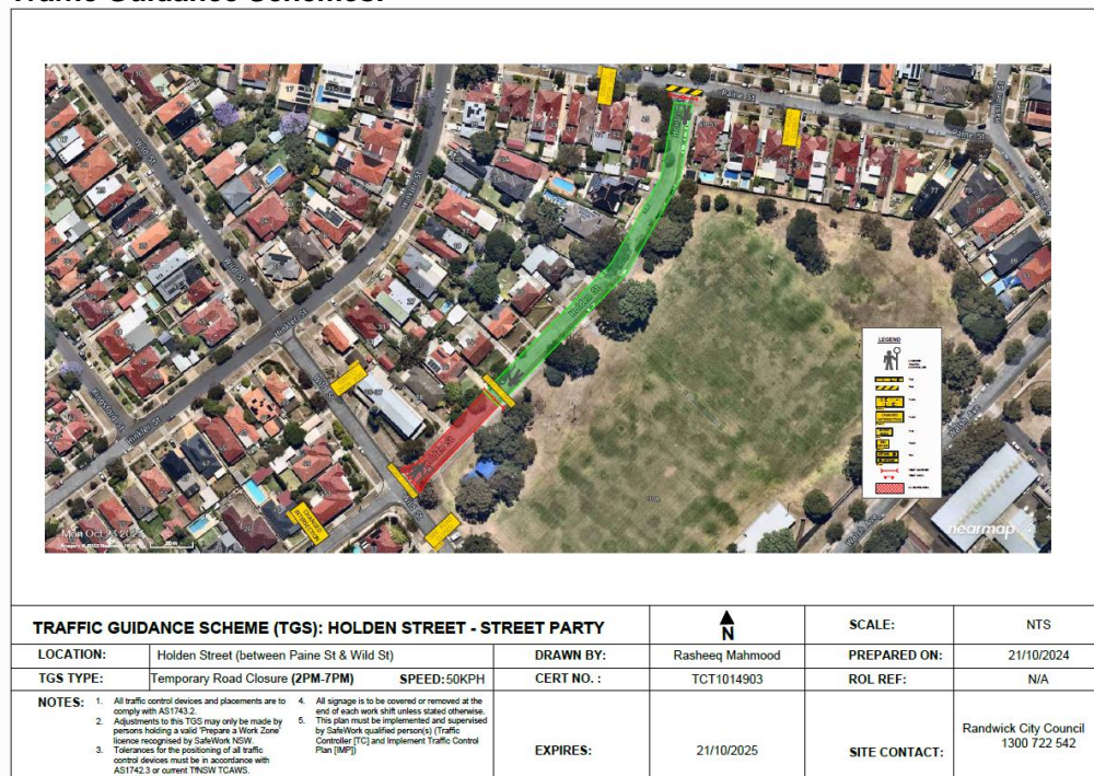
Figure 1: Holden Street, Maroubra