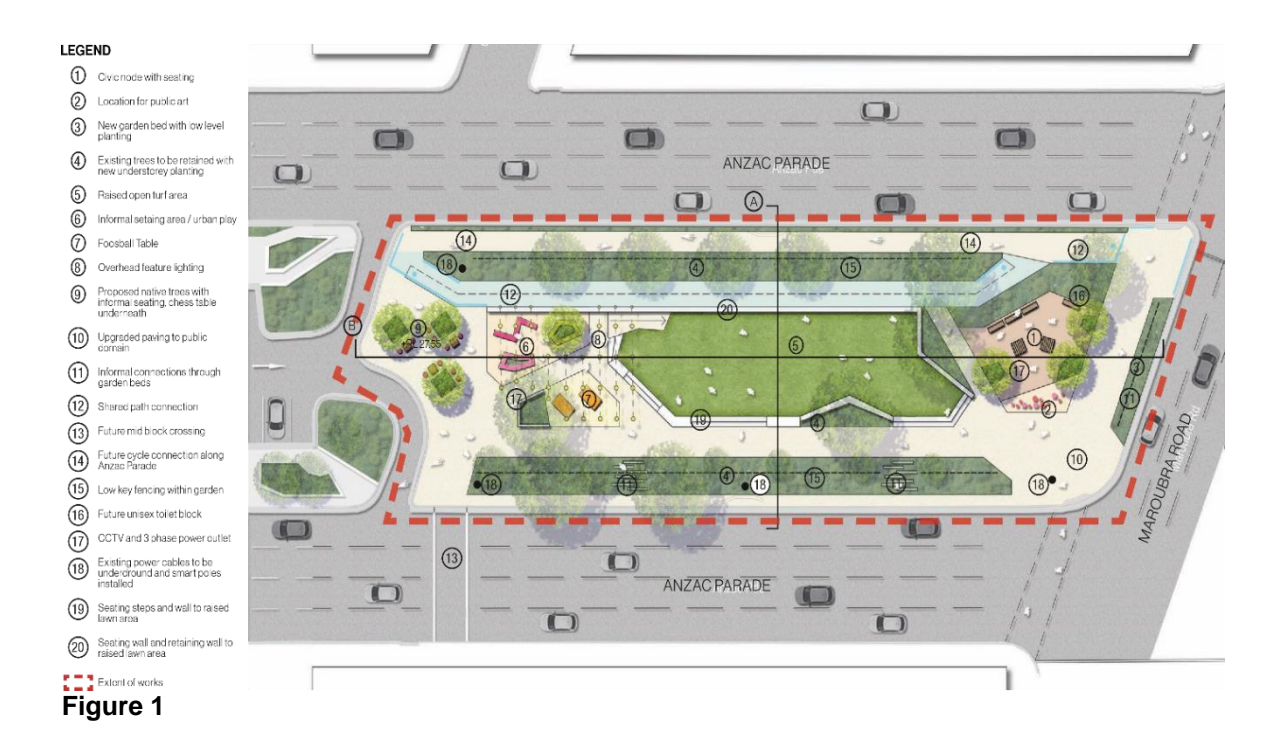
Figure 1 shows the concept as previously recommended to Council for both Stage 1 and 2 of the Oasis projects in February 2022 to a project value of $2,150,000.

Cognisant of Council's decision to proceed with Stage 1 only which was to be entirely funded through the grant program, Council officers were concerned that the connectivity of Stage 1 with the adjacent area, will create amenity concerns. To mitigate this risk, staff revisited the concept and scope of works in order to ensure the project was consistent with grant objectives and provided maximum benefit to the community.